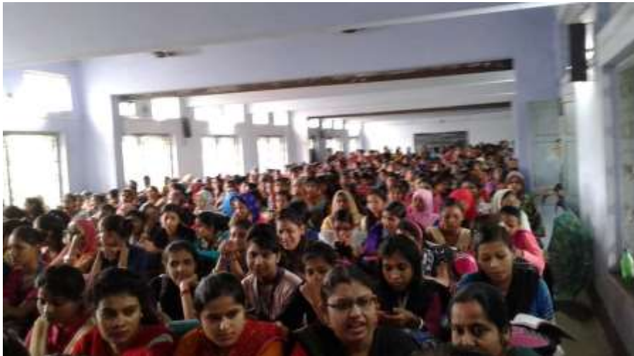
Organization of the programme on Cyber Crime and Safety of Women